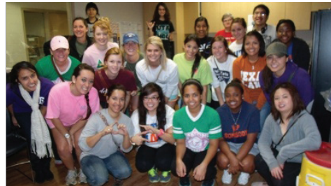
The Animal Services Center received a gift of volunteerism from 23 UT Arlington students on December 23. The shelter was scrubbed from top to bottom, and many pets enjoyed the socialization provided by this energetic and enthusiastic group.