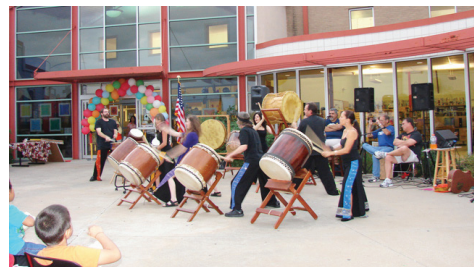
The East Arlington Branch Library celebrated the cultural diversity of the community on October 20 at the annual Courtyard Celebration. Local performers included the Bowie High School Salseros, Thornton Strings, Show Stoppers Step Team from Hutcheson Junior High, the Spirit Squad dancers, and Irish step dancers.