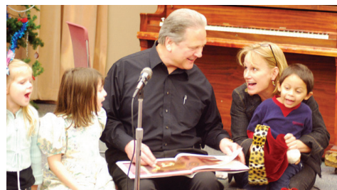
The Mayor's Holiday Party for Children was held on December 8, 2012, at the George W. Hawkes Central Library. Performers from Theater Arlington and Symphony Arlington provided additional entertainment for the children.